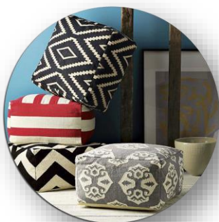
Poufs / Stools