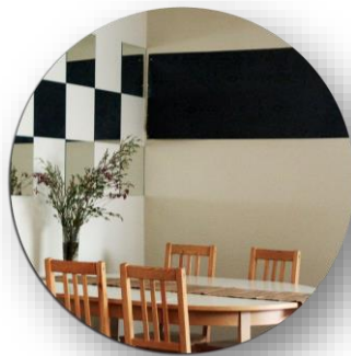
Table Covers / Mats / Runners