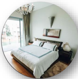
Bed Covers / Linens